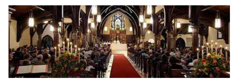
Trinity Episcopal Cathedral, Little Rock, AR

(A side note, if you have standing reservations it would be help to confirm you are on the list!)